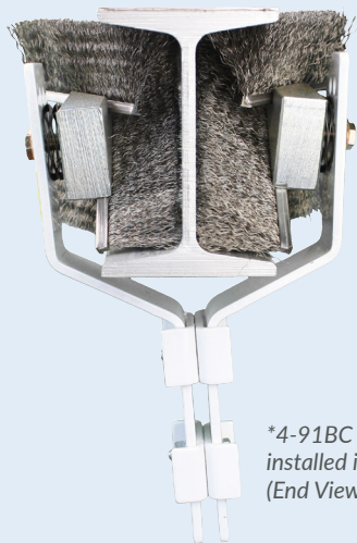
*4-91BC shown installed in rail. (End View)

Complete assemblies are shipped with brushes pre-assembled