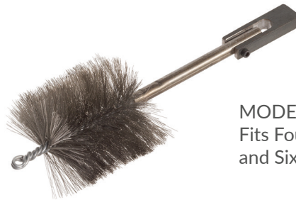
MODEL #40Y Fits Four Inch and Six Inch I-Beam

See our website for information on Powered Cleaners as well as other Mighty Lube Equipment.