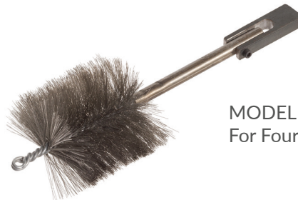
MODEL #40Y For Four Inch I-Beam

See our website for information on Powered Cleaners as well as other Mighty Lube Equipment.