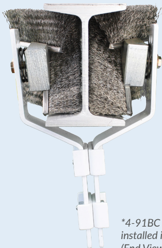
*4-91BC shown installed in rail. (End View)

Complete assemblies are shipped with brushes pre-assembled