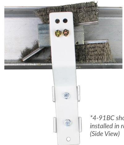
*4-91BC shown installed in rail. (Side View)