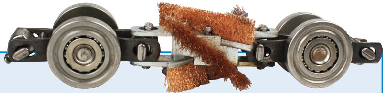
* Shown Installed in Chain

* Phosphorus Bronze brushes are standard for UN91 assemblies and replacement brushes. Stainless Steel brush assemblies (PART # UN91SSA) and replacement brushes (PART # B913BRTB) are also available.