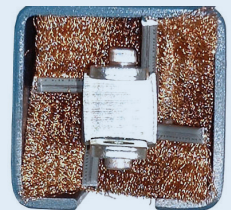
* Shown Installed in Track

NOTE: you do not have to remove link and link screws to replace brushes