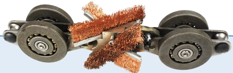
* RW91 Shown Installed in Chain

* Phosphorus Bronze brushes are standard for RW91 assemblies and replacement brushes. Stainless Steel brush assemblies (PART # RW91SSA) and replacement brushes (PART # B91316RB) are also available.